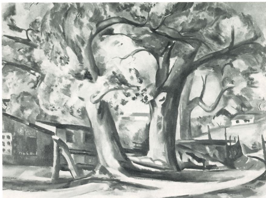
COTTONWOODS, c. 1938

UNTITLED (Rapids), undated watercolor, 15½ x 21¼