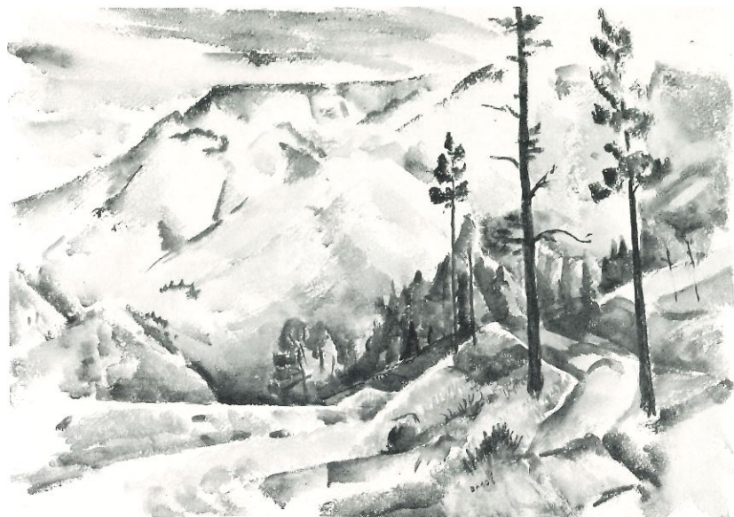
EARLY SNOW, undated