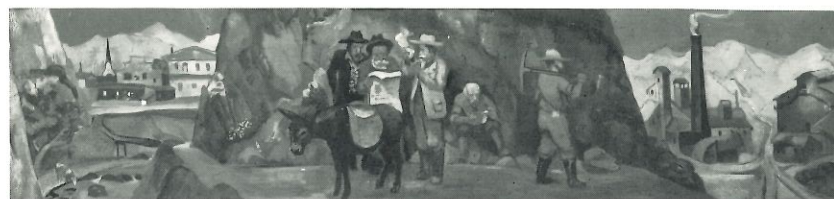
UNTITLED (PROSPECTING), 1938