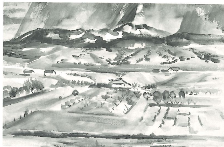
SPRING STORM, VELARDE, N.M., c. 1943-44