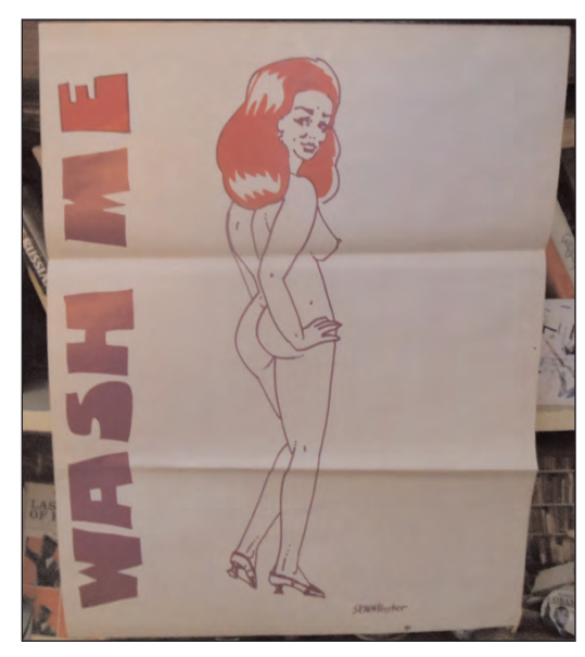
Spain in Comic Art Show at Peace Eye November 7, 1968

Spain designed a series of posters for Peace Eye which I had printed in late '68. Here's one of them, titled "Wash Me":