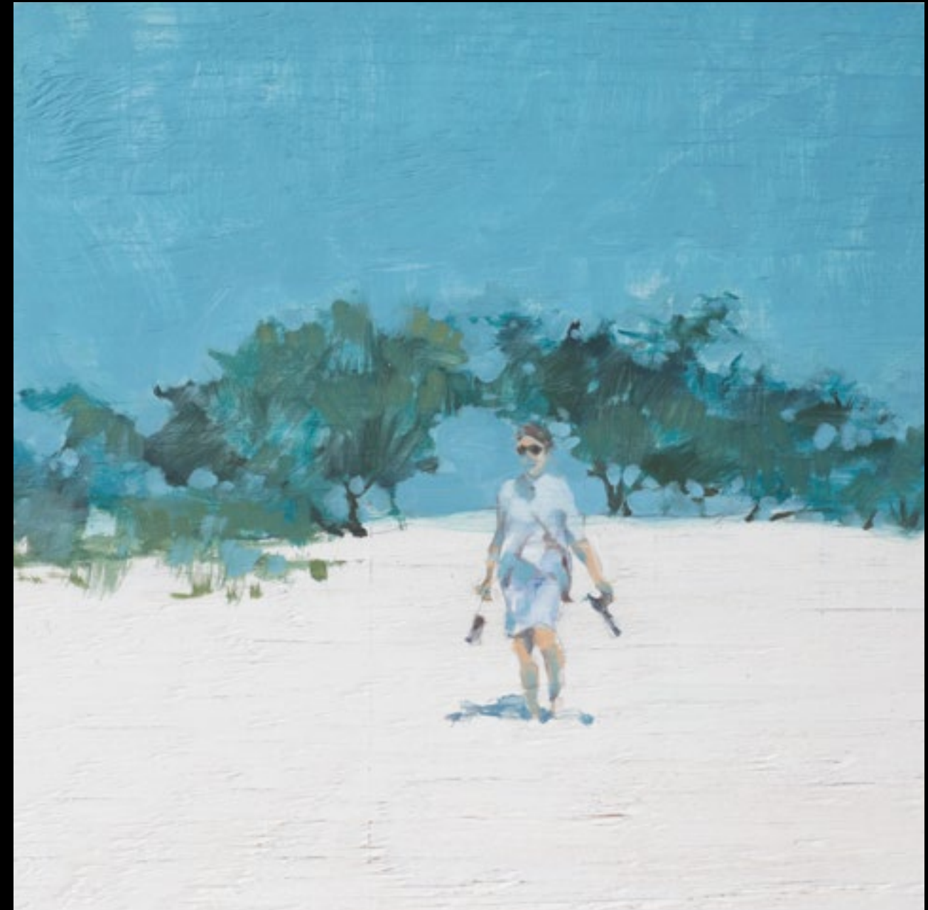
edie on the beach