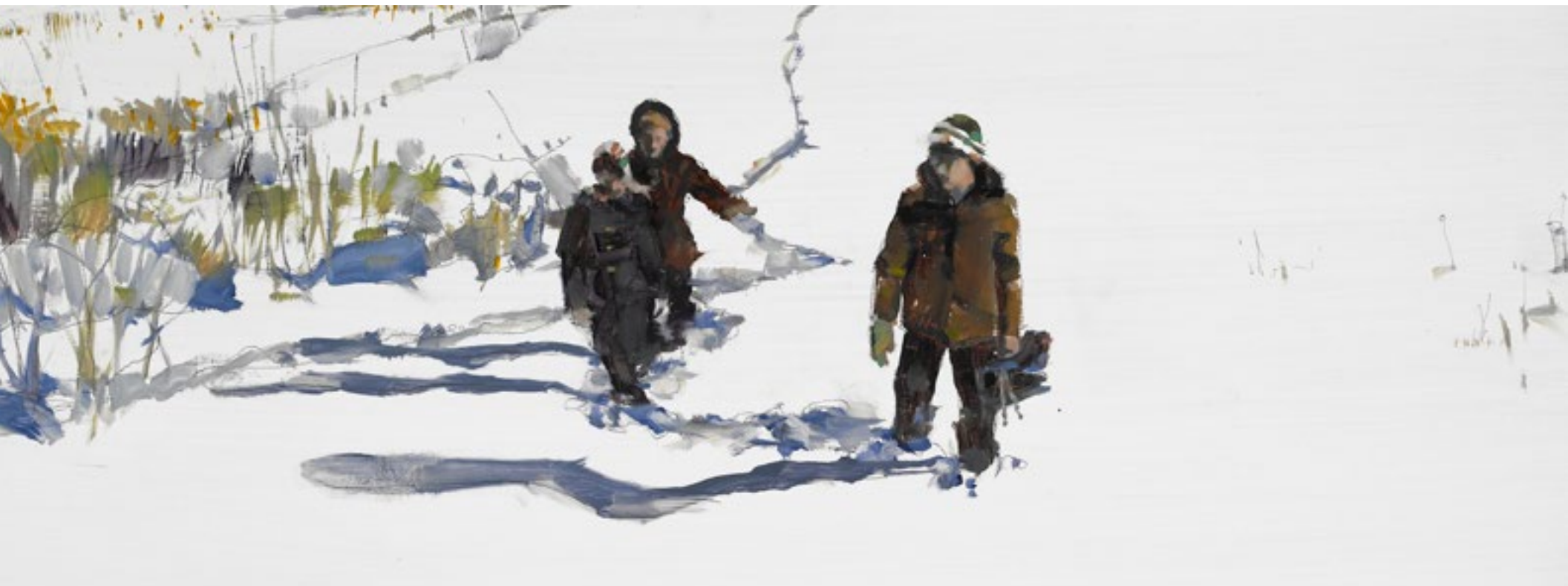
the skating party