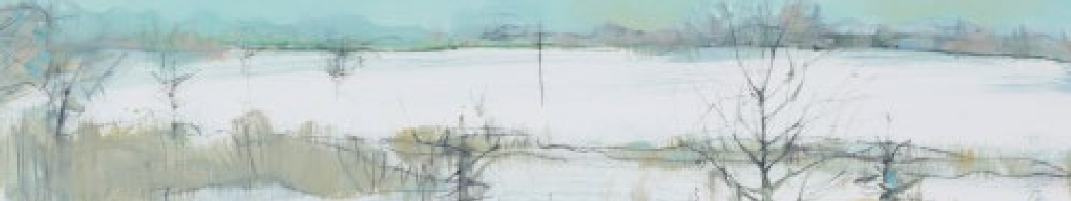
the small pond